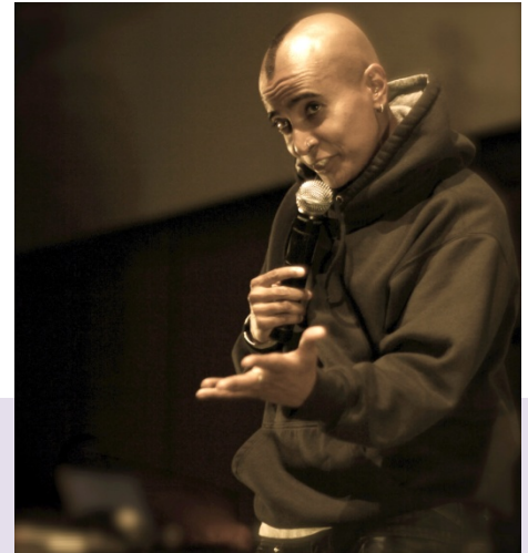
From D'Lo web site. Photo: Tani Ikeda

While most of us agree that we enjoy humor, it is much more difficult to agree on what is humorous. Humor is unique to individuals, cultures, and times, and in order to be appreciated it must be placed in a context that is easily understood. Comedy operates on an understanding of our shared social norms and customs, national ethos, and our underlying mores. When Seinfeld posits, “What is a date