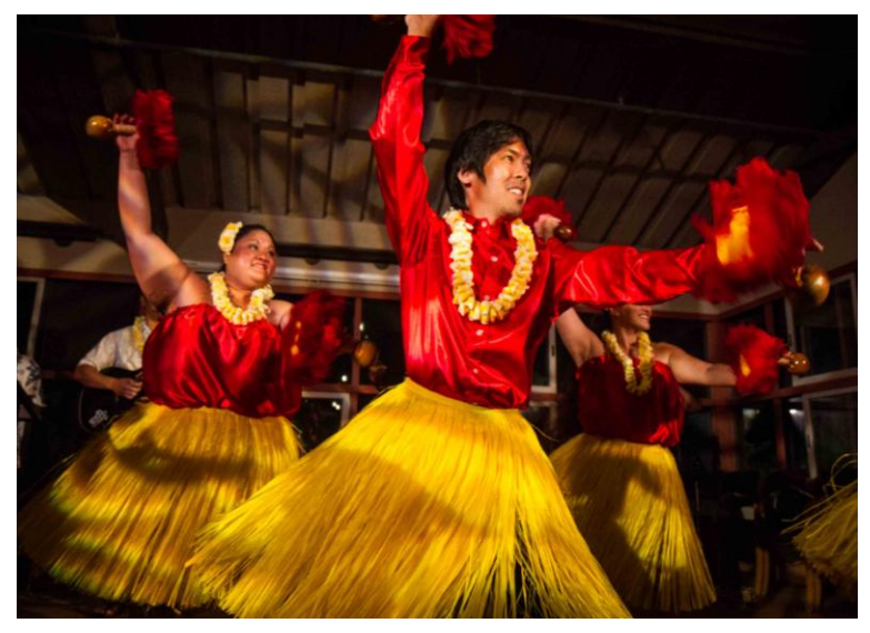
Hula performance at a traditional laua presented by the PA'I Foundation and the Pua Ali'i 'Ilima halau.