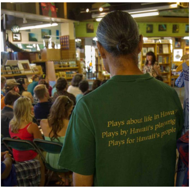
At a staged reading by the Kumu Kahua Theatre in the Kaka`ako neighborhood.

All this discussion of what ensemble theater means to the variety of participants who fit under its umbrella can detract from the