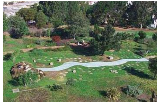
In the Moment , Rick Carpenter, 2002, one of more than 35 sculptures created through the Recology Artist in Residence Program at the San Francisco Dump. The sculpture garden functions as a buffer between the dump's transfer station and the adjacent residential neighborhood. Recology is a private, employee-owned company that provides waste collection, recycling, compost, and disposal services.

Lastly, the elegant display of nature-related information and collections has itself become a form of artistic commentary. As windows through which we frame and view the world, our institutions and cultural infrastructure have their own idiosyncrasies and historical models to explore, poke, and dissect. Nearly any topic, from evolutionary theory to local natural