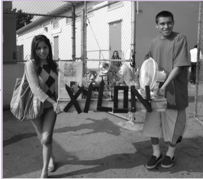
Greg Niemeyer's Black Cloud project enlists youth in Los Angeles, California, and Cairo, Egypt in measuring air quality in polluted neighborhoods. The Xylon team carries its model for an improved neighborhood from Manual Arts High School to the Machine Project Gallery.

A collection of writings depicting the wide range of ways the arts make community, civic, and social change.