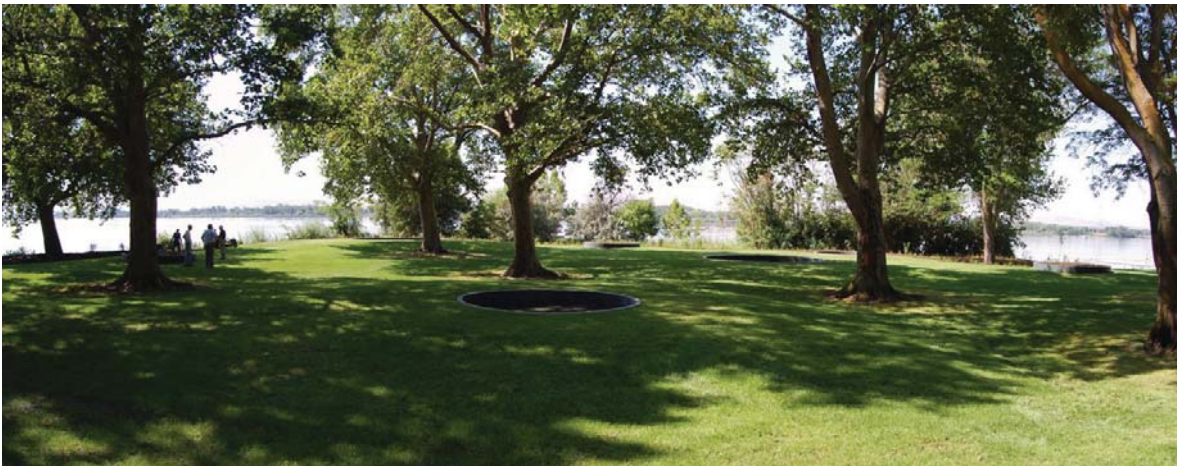
As part of the Confluence Project, Maya Lin's Story Circles at Sacajawea State Park tell seven confluence stories of history, people and culture where the Columbia and Snake Rivers meet. A combination of natural forms, restored Native landscape, and the words of both western explorers and Chinook people offers opportunity to contemplate the larger story of the land.

The point to take away from all this is that many concepts in these and countless other disciplines are beginning to converge. It matters less what we call it, so long as people can work together to make sound ecological stewardship a bit more aesthetically and metaphorically rich (and therefore more culturally sustainable). Almost any place is a good place to start.