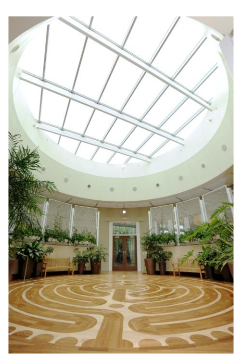
The labyrinth meditation room at the National Intrepid Center of Excellence in Bethesda, MD.

Leading the way are the <u>Walter Reed National Military Center</u> (WRNMMC) and the Department of Defense's <u>National Intrepid Center of Excellence</u> (NICoE), located on the WRNMMC campus. WRNMMC has instituted a growing number of arts programs for service members, staff, and families. The Stages of Healing monthly performance series hosted by the WRNMMC Department of Psychiatry includes bedside performances in individual wards and patient