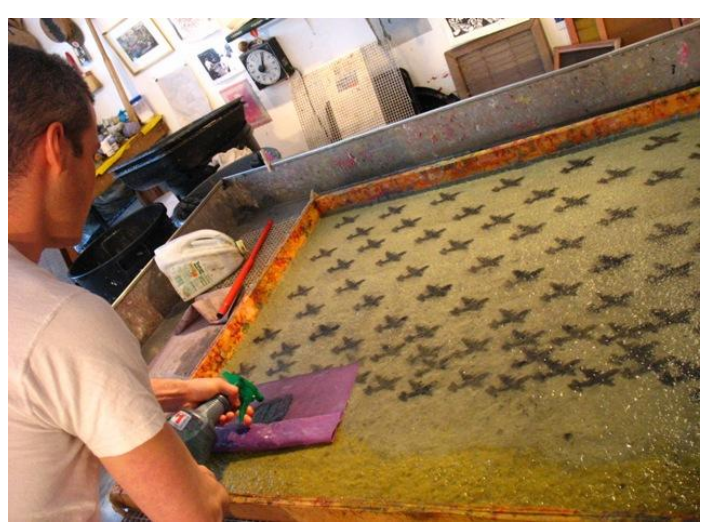
Combat Paper, silkscreen printing using overbeaten cotton fiber.

out, attempting to reconcile personal issues from their combat experience through art before moving on to work with a broader focus to bridge gaps of knowledge and communication between civilian and veteran communities. The works created in and inspired by these workshops have been powerful tools for conversation and expression, and the pieces have found homes in gallery showcases and installations across the country. The project is based in California, and since its inception the Combat Paper workshop has made tour stops in Michigan, Texas, Nevada, Washington, DC, New York, and Kosovo. The results of